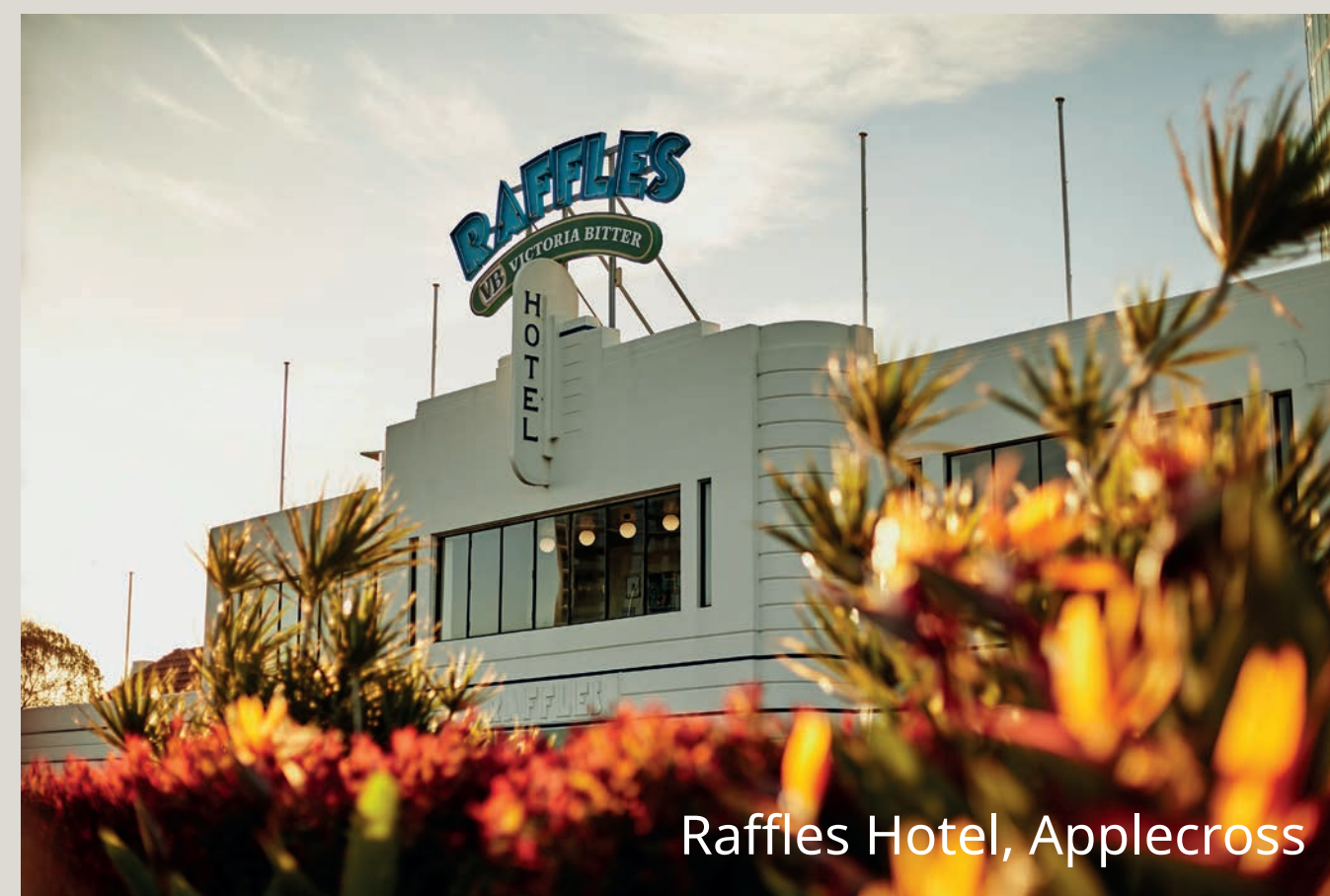
Raffles Hotel, Applecross