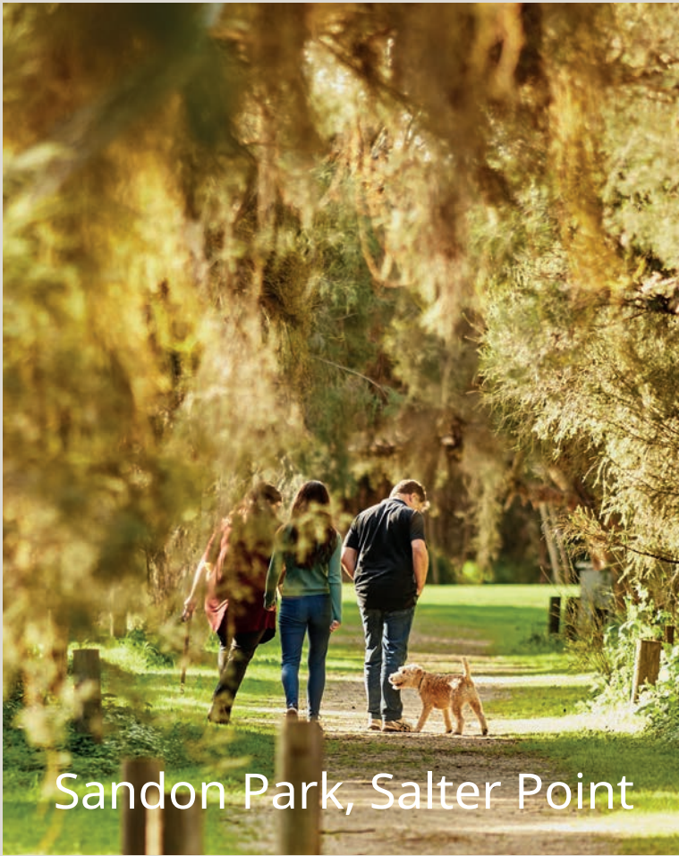
Sandon Park, Salter Point