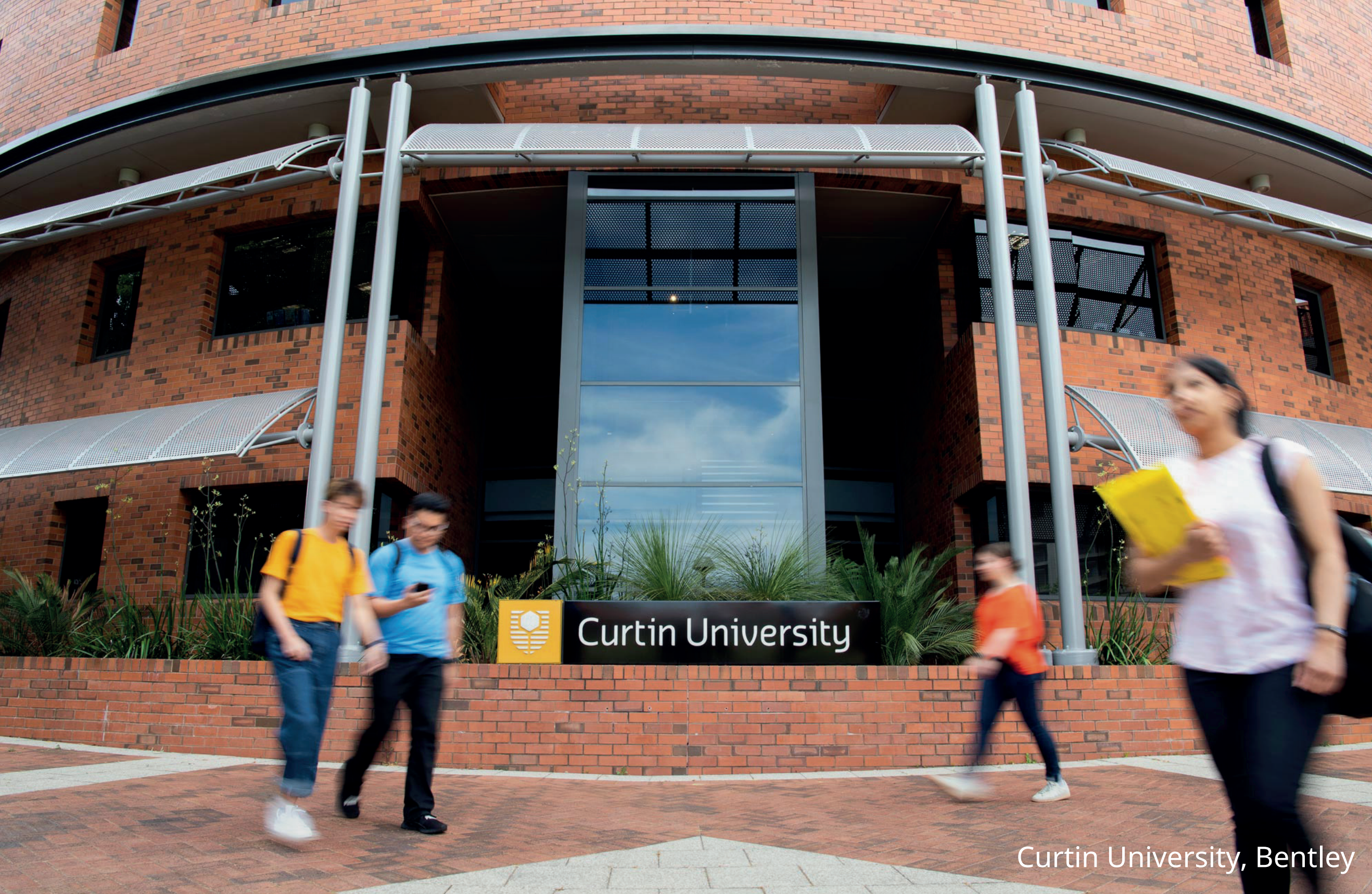
Curtin University, Bentley

Canning Bridge Train Station is just a short drive away, making commuting to the CBD and Fremantle a breeze.