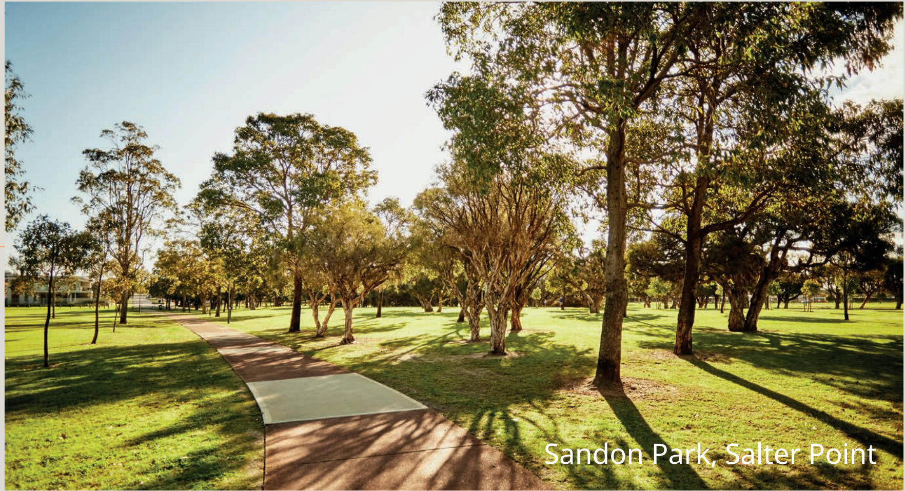
Sandon Park, Salter Point