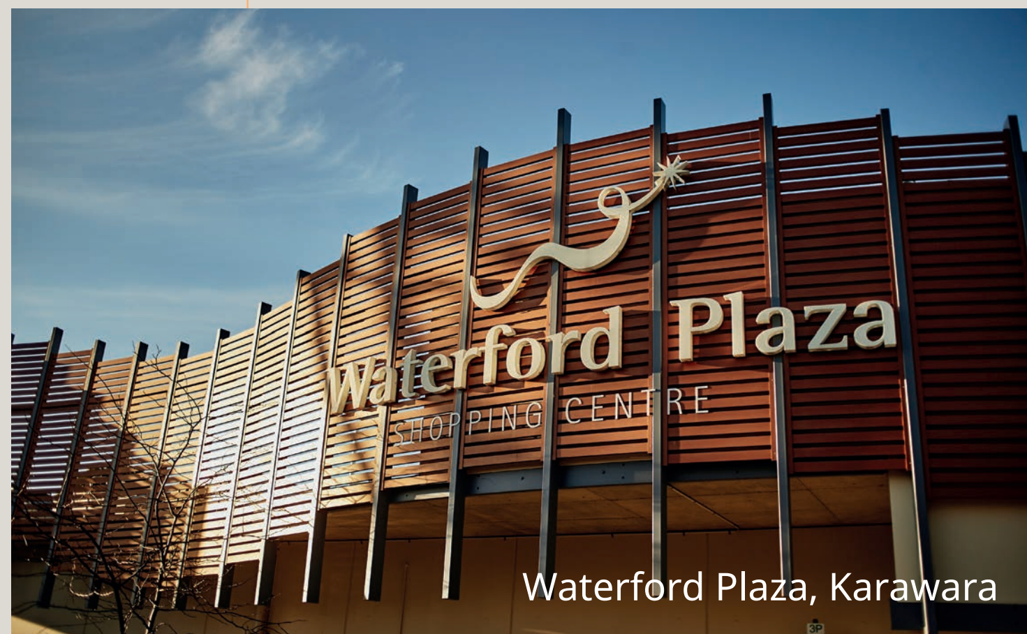
Waterford Plaza, Karawara