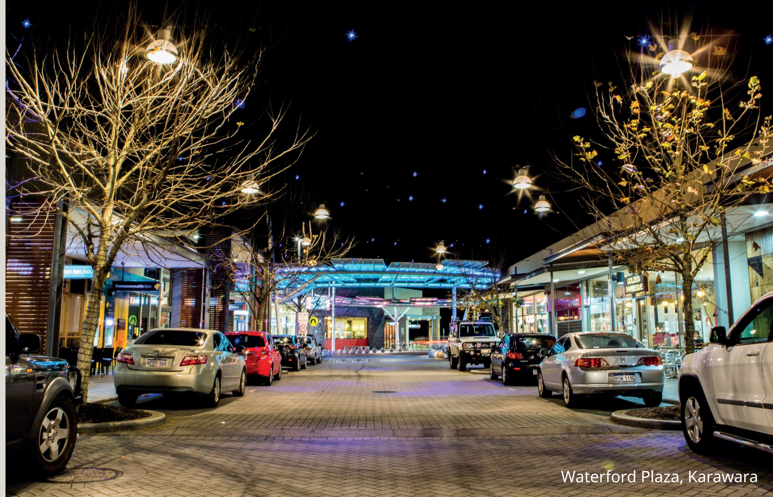
Waterford Plaza, Karawara

Head down to the foreshore, find a new favourite among the many local bars, cafés and restaurants, or discover the many recreational options on your doorstep.