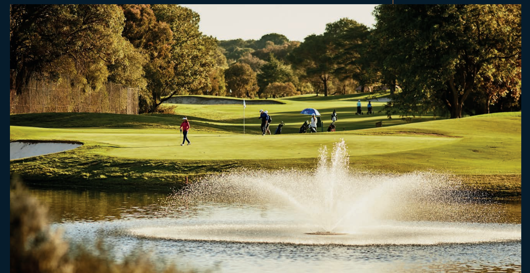
Collier Park Golf, Como