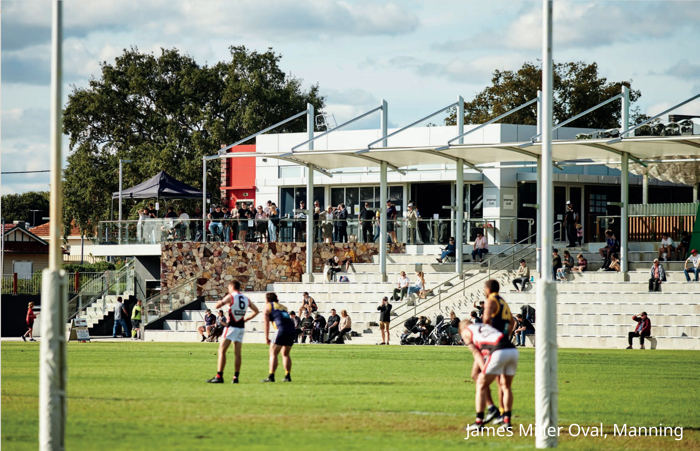
James Miller Oval, Manning

Plus, with the upgraded James Miller Oval just a few steps away, you'll be able to head outside for fresh air and exercise whenever you choose. With 16 secure bicycle racks available within the development, exploring on two wheels is also an attractive option.